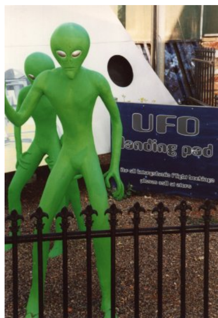
UFO Landing Pad

Disused 1 hectare former UFO landing pad at Wycliffe Well, nicely situated half-way between Tennant Creek and Alice Springs.