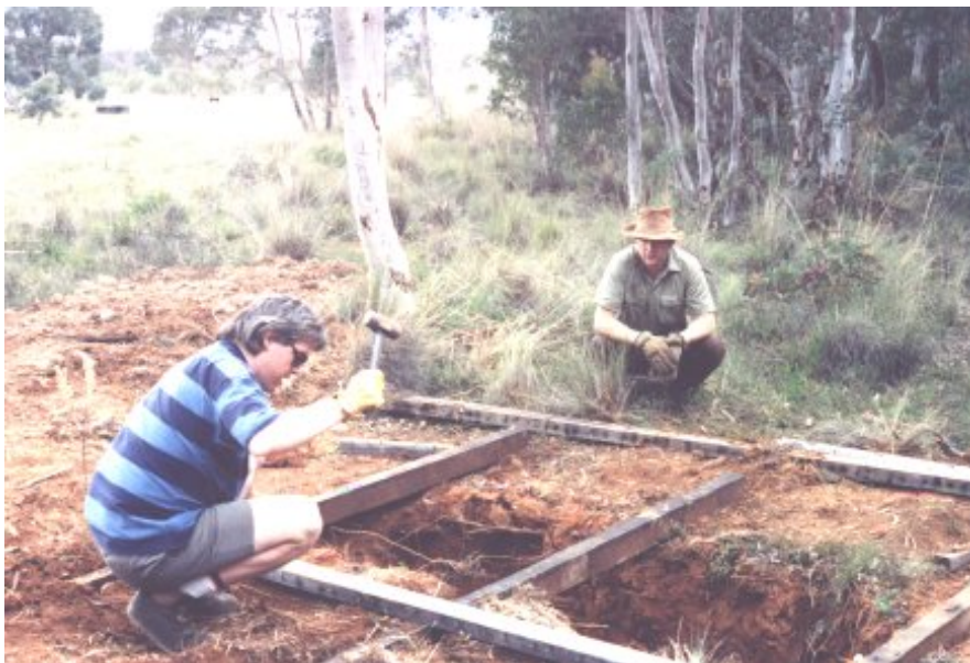
Preparation of the Lawn Cemetery at Wiruna

Members are asked to postpone dropping off until at least 2004, as we do not feel that the site will be ready to receive guests until then. As a special public duty, the Society offers to the Australian public at large a free service to self confessed intellectuals, retired politicians, and media gurus.