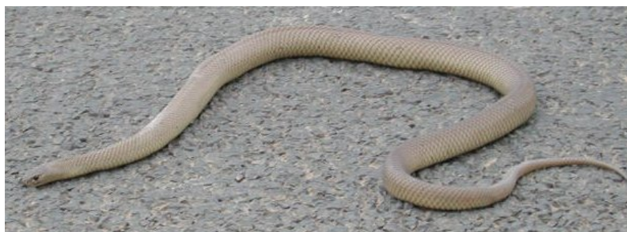
A McMickle-Preferred Eastern Brown Snake

It has recently been confirmed that the famous Great Nebula in Andromeda, M31, is on a direct collision course with our own galaxy.