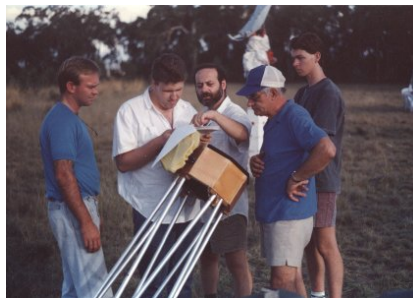
Which End Does the Mirror Go?

taken on the matter before the telescope was finally assembled.