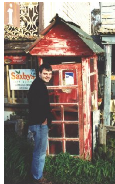
The New Phone Box for Wiruna

The phone box is scheduled for removal from Sofala's main street to make room for the new Cinema complex, Shopping Mall, and Opera House currently being planned by the Darwin Awards Foundation, of Walla Walla, Washington, USA.