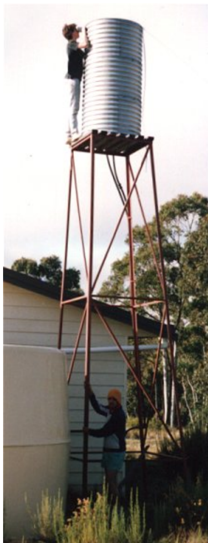
40" f/6 Zenith Scope

toxicity in venom that some persons bitten have recovered, and lived, without the need of medical assistance. Initial tests have been encouraging.