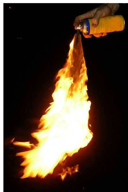
The Portable Instant Optics Demister In Action

However, from New Zealand again, the Land of the Long White Cloud, lots of rain, fog, dew, and damn few clear nights, comes a product designed to maximise those clear nights and give instant dew zapping.