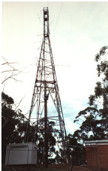
35m Radiotelescope Tower

After some careful research, the simple expedient is being put into effect - that of placing it closer to the radio sources being studied. A surplus 35 metre high tower has been secured and will be dismantled and re erected on the western (or upper) observing field by April 2003.