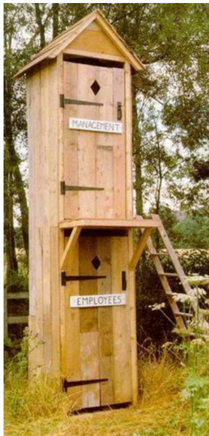
Two-Storey Prototype of the Proposed Three-Storey Dunny

class scientific facility, and unique in the astronomical world - a Quad-Telrad Comet Seeker, the only one residing inside a giant replica of an Australian icon.