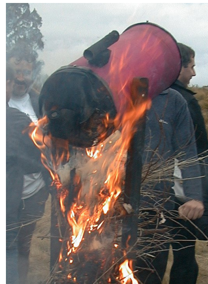
Spontaneous Combustion of a Telescope due to Global Warming

As a health and fitness conscious freak, he has designed a series of meditations to slow the heart rate, and hence the rate of breathing and CO 2 exhalation.