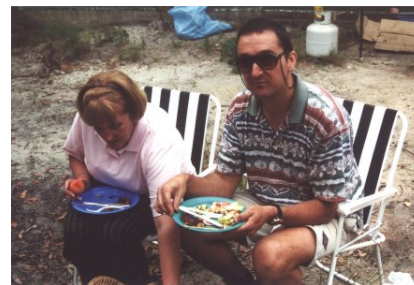
Sampling a Gourmet Recipe

Take one Ukranian Chicken (either 3 or 4-legged is suitable). Cut off both heads and remove all feathers using a blow-torch or angle-grinder. Stew in a lead-lined pot, preferably whilst wearing a cast iron Sporran.