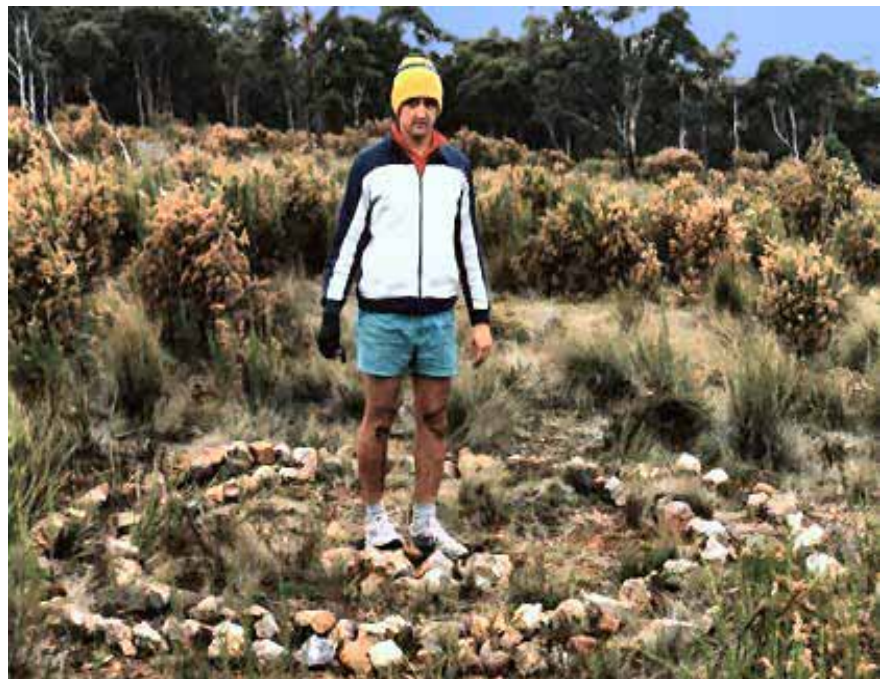
ASNSW Member standing in one of the Stone Circles at Wiruna

Elements of these rites included brewing the sacred poteen, and communing with the Great White Spirit.