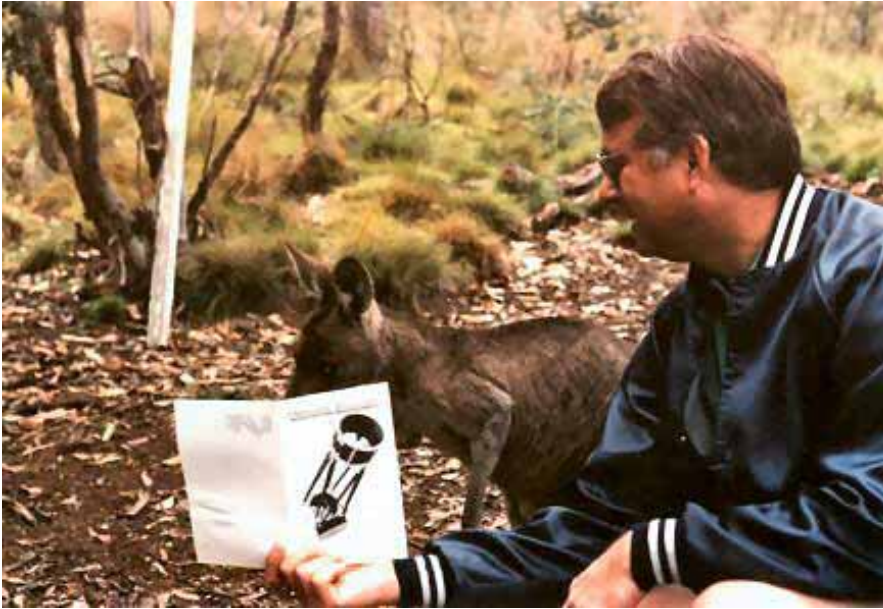
New member being educated about telescope construction

She doesn't let this worry her however, as with one eye still in full working condition, she regularly observes through the telescopes of ASNSW members during their visits to the National Park at Mt Kaputar.