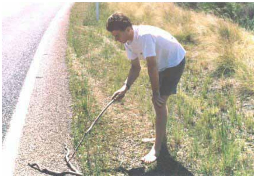
ASNSW Member considering the feasibility of Snake Racing at Wiruna

The University will gratefully accept all donations of spiritous beverages, so that the witnesses can be properly interrogated in the right state of mind, by interrogators in a like state.