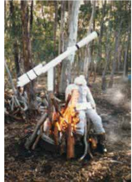
Drying out your dewed optics... quickly

Leaving the flames burning longer has been known to result in slight aberrations in the primary mirror, and a small number of cases of burnt-buttock syndrome have been reported in the user.