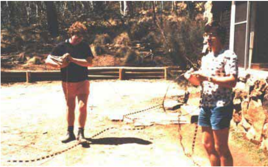
Distance to Siding Springs being measured, from Mt Kaputar

positions on Mt. Kaputar in the States North West, and from Siding Spring Observatory, near Coonabarabran.