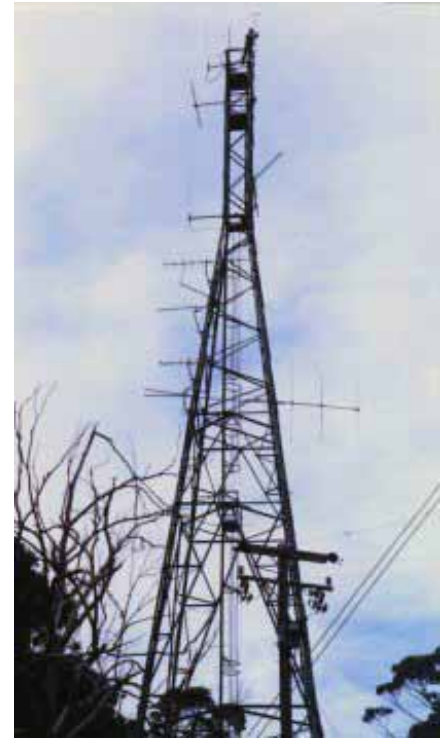
The new Antenna recently installed at Wiruna

This increase in height will put the receiver significantly closer to the source of the recently identified signals, thus resulting in an enhanced reception, high-gain antenna, rare amongst amateur astronomers!