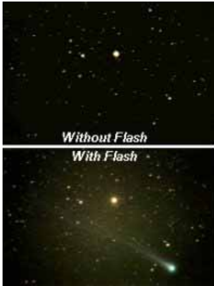
Photo of Comet Hyakutake with and without a Flash

Why has this simple photographic aid taken so long to catch the attention of astro-photographers?