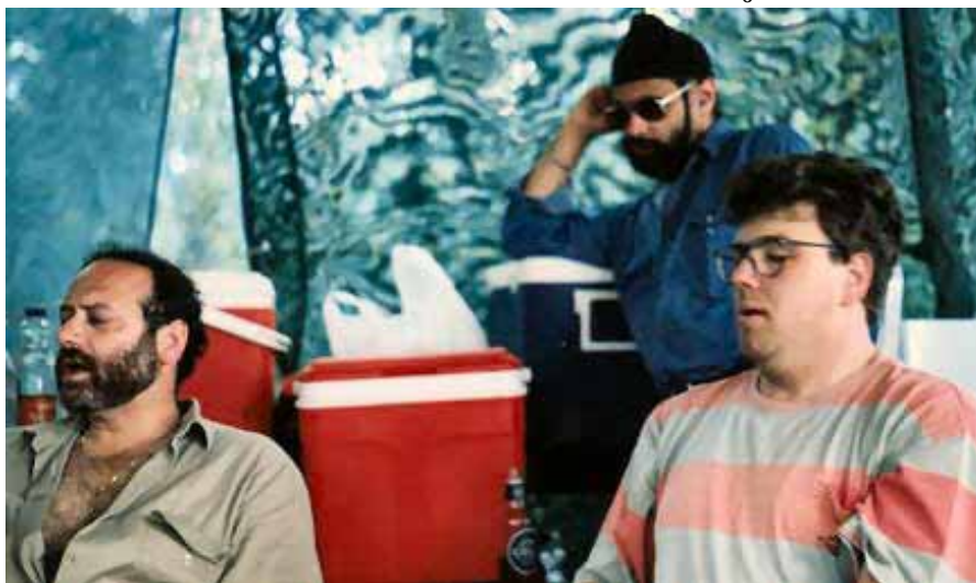
ASNSW Choir Members rehearsing a duet at Wiruna

Music is also a feature of Wiruna, where several talented guitar players can be heard playing among the trees, while the Wiruna choir has a wide range of songs with which to delight the listener (see photo over page).