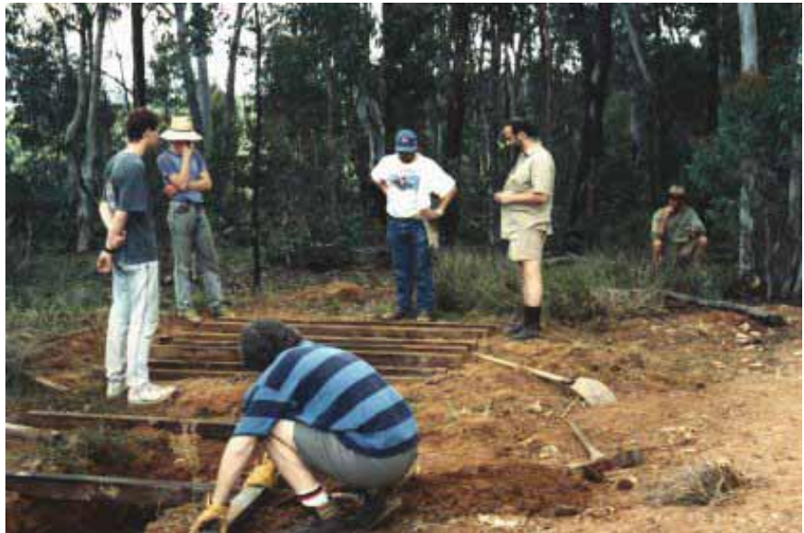
Construction of the Neutrino Detector at Wiruna

As well as being amateur built, the detector was the world's only interferometric model and was based on an original design by Rube Goldberg, Honorary Health and Building Surveyor of Hog's Wallow County, Arkansas.