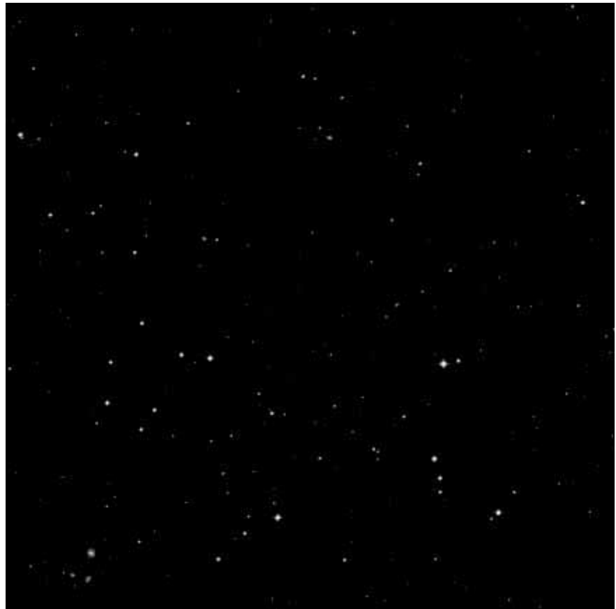
The beautiful South Galactic Pole

The image below, shows the South Galactic Pole itself (somewhere in there), while the image over the page, is a finder chart, adapted from Uranometria 2000.0 Volume II, map 307.