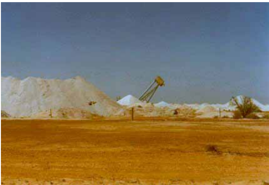
One of Harry's underground Observatories, showing the diagonal and spider emerging from the shaft of the observatory

The search for a stand-in of sufficient status continues.