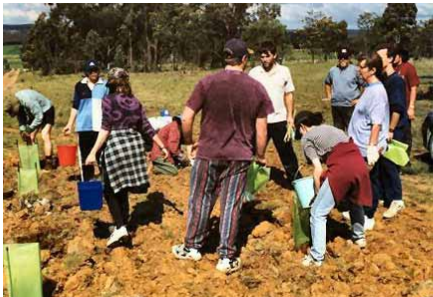
ASNSW Agricultural Team at Work planting new trees

Experiments using dummies fitted with multiple sensors (see photo above) have been conducted at previous Star Parties, and volunteers (both human and telescopic) will be sought for future experiments, so that the method can be further refined.