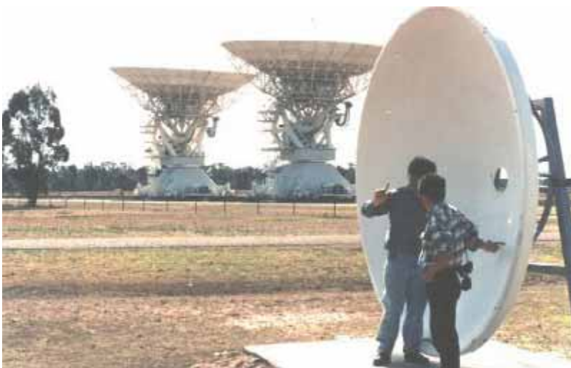
First Extra-Terrestrial Signals being analysed

Initial evaluation of the frames suggest that the radio waves are part of an intergalactic sitcom concerning the doings of four dysfunctional sentients sharing the same asteroid, the first signals