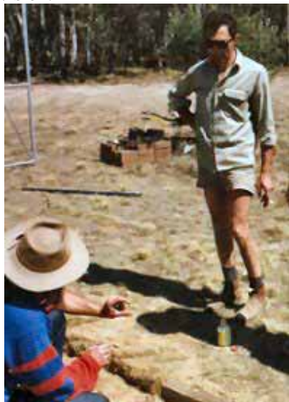
Demonstration of the effects of cold weather at Wiruna

Following this, he has tested the theories of Dr. (Papa Doc) Duvalier, of Port Au Prince Haiti, whose historical research had convinced him of the importance of head warming, for enhanced night vision.