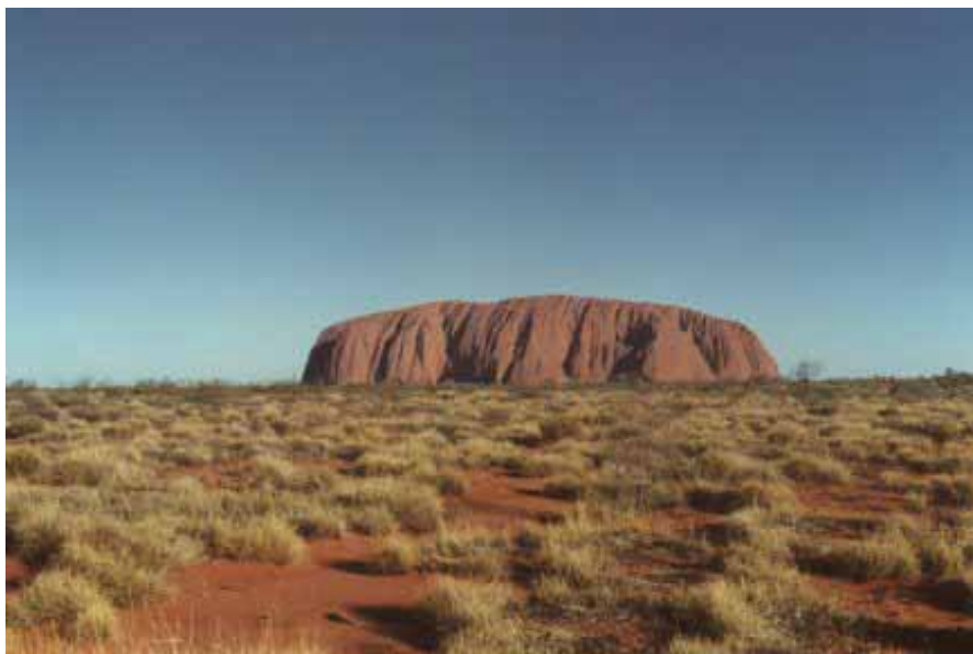
Ayers Rock... An Ancient Meteorite?

An amazing discovery was made. A pattern of deeply buried anomalies which showed up in the multiple ultrasonic scan demonstrated that there had been not one, but three impacts about 800 million years ago.