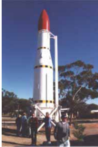
Modified Rocket at Woomera for launching to the Sun

conduct experiments in fusion reaction, and extraction of Hydrogen from the Sun.